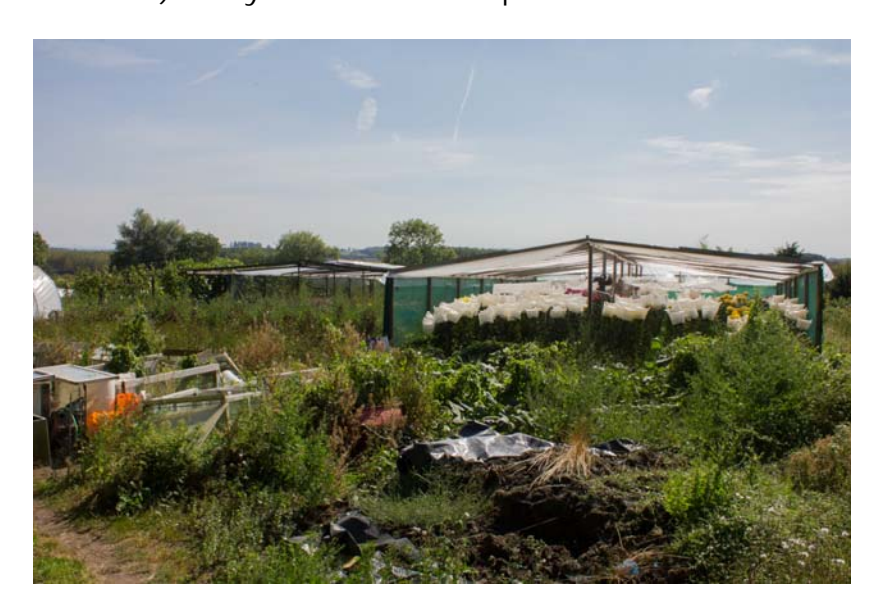
Church Piece allotments

Situated on Queen Catherine Road opposite St Michael's church (1.05 hectares). Fully used allotment plots.