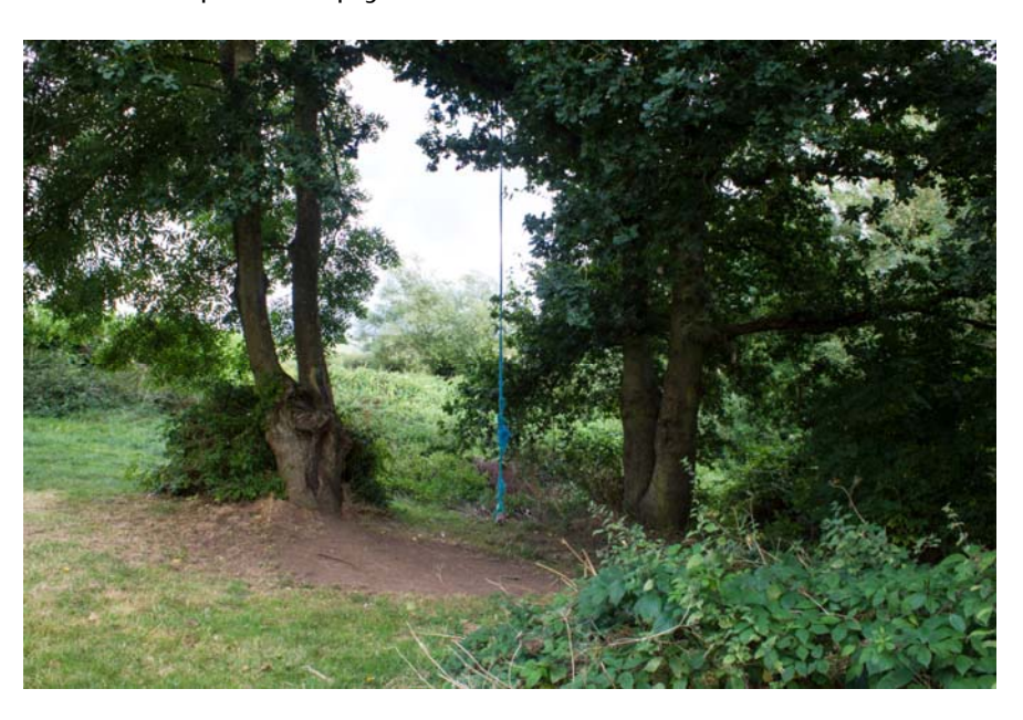
Area east of Rookery Way

Small wooded area (1991 \mathrm{m}^2 ) to the east of Rookery Way/Sandholme. Ground slopes steeply with small stream at bottom.