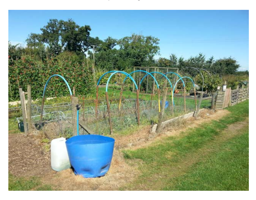
North End Road allotments

Situated at the junction of North End Road and Buckingham Road (1.8 hectares). Twenty fully used allotment plots. Owned by the Verney Estate and leased to the Steeple Claydon Allotment and Horticultural Society.