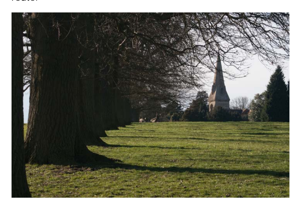
Land south-east of St Michael's church surrounding the churchyard

Field with distinctive ancient ridge-and-furrow contours, and an avenue of mature oak trees. Adjacent to the Bernwood Jubilee Way recreational route.