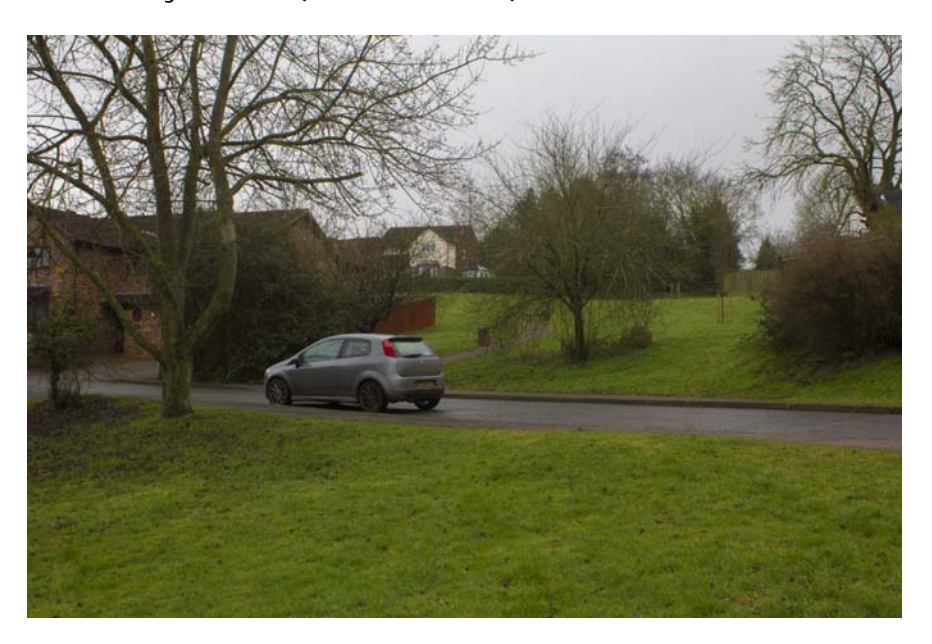
Green space in Meadoway

Areas laid to grass with ornamental trees and footpaths, running through Meadoway estate (0.43 hectares).